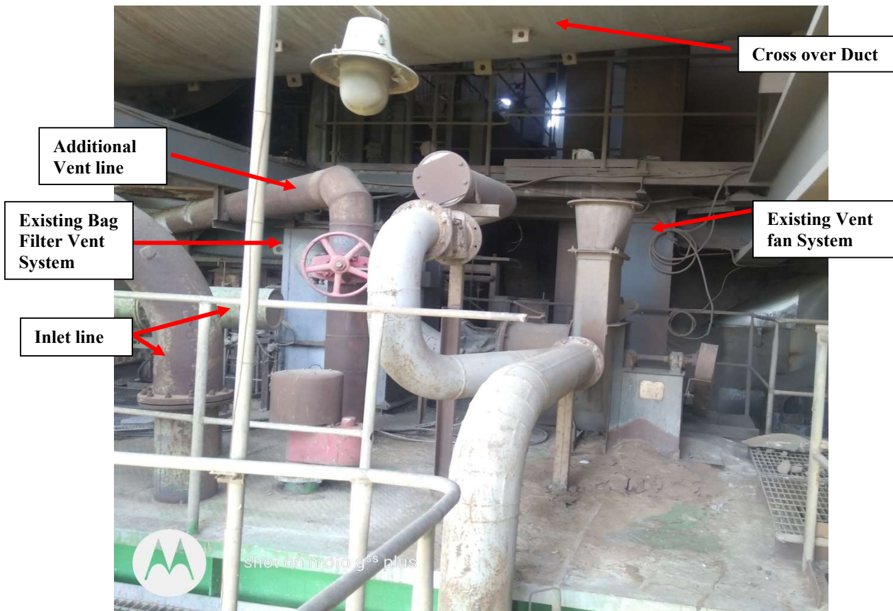
Bed Material Silo-top view